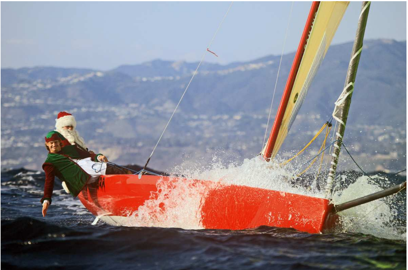
Santa is on his way!