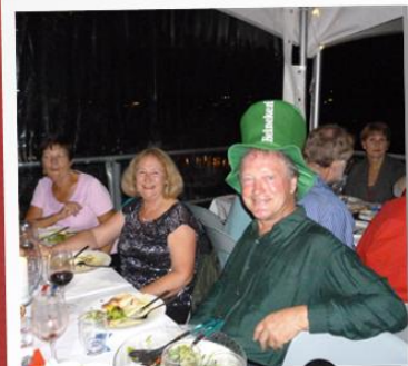
WHERE DID HE GET THAT HAT!