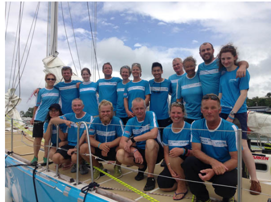
The Unicef crew depart Airlie Beach for Vietnam