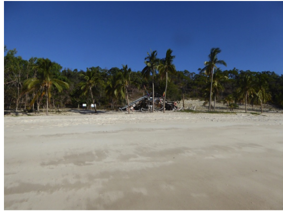
A-frame on Middle Percy Island

Middle Percy was named by Mathew Flinders in 1802 after the Duke of Northumberland's family name. The island has a colourful history too detailed to mention here. Behind the beach is an A-frame construction, called the Middle Percy Yacht Club, which sports memorabilia from passing travelers. The A-frame is 'free to use by all seafarers' – as long as you take your rubbish with you.