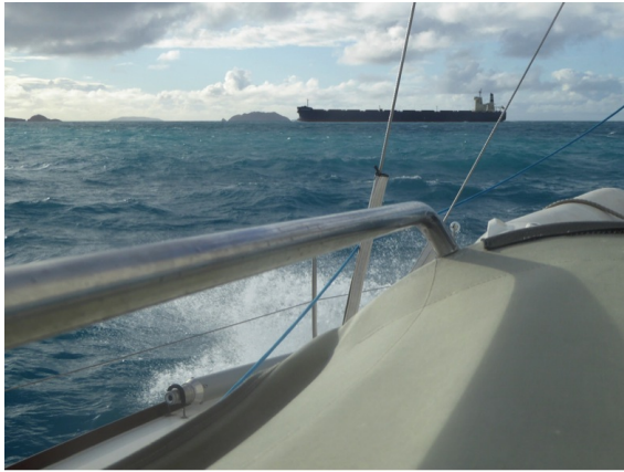
Coal Carrier bound for Hay Point