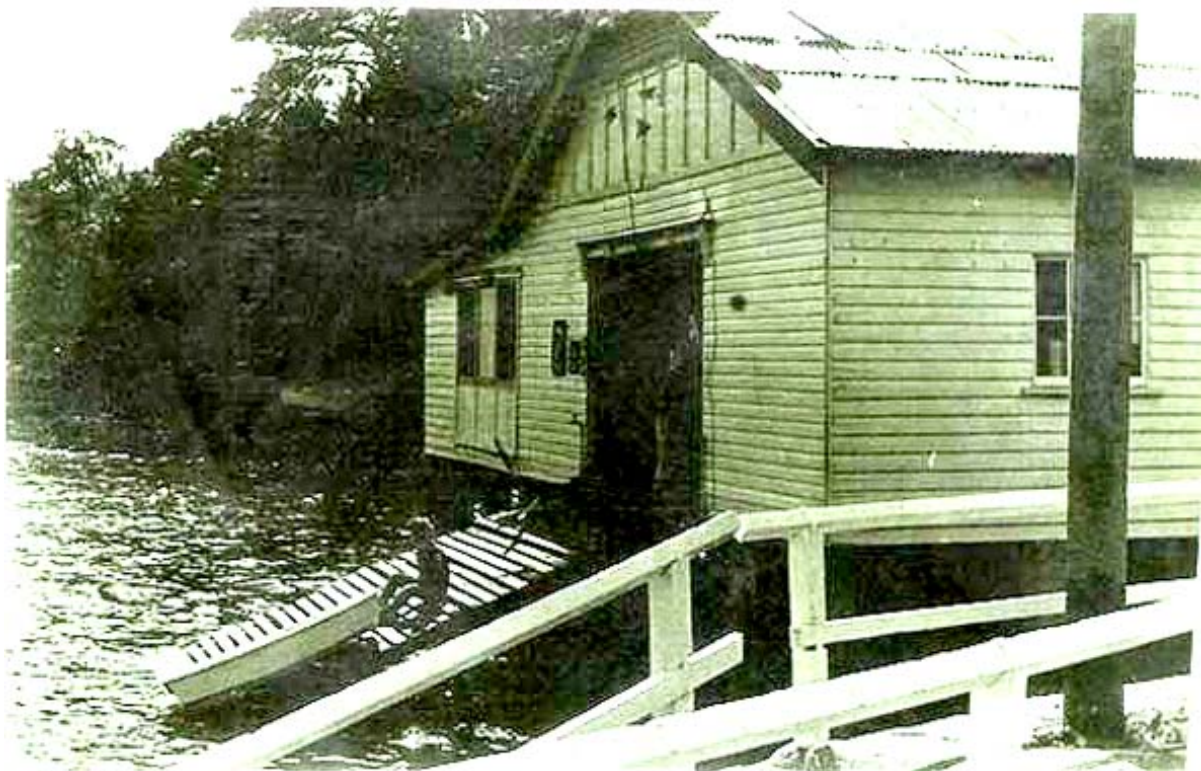
The GFS clubhouse pictured in 1972

On page 12 of the club's history book Greenwich Flying Squadron: The First 75 Years is a 1912 photo of the clubhouse when it was a boat shed with adjacent ferry waiting shelter. The photo here shows the GFS clubhouse as it looked in 1972, and of course we all know what it looks like today!