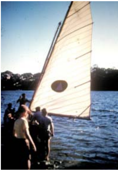
Rigging the gaff-rigged Zest at the Greenwich 16ft club at Greenwich Point