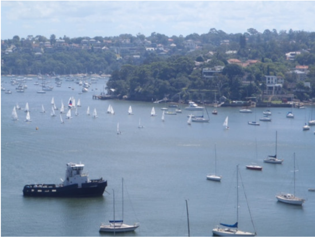
Lasers lining up for the start of Heat 4 by the GFS clubhouse