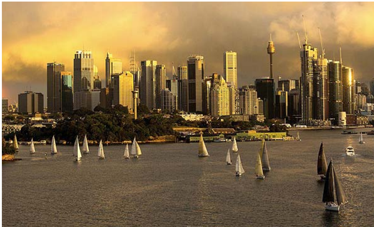
GFS Twilight Racing March 2016.