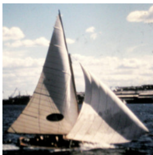
Zest under sail

In 1951 a young Dutchman touched down in blistering 40 degree heat in Cloncurry, outback Queensland. In those days the aircraft from Europe had to make several stops before reaching Sydney. Surveying the parched and barren landscape from under the proverbial hot tin roof, the scene was nothing like his imagination of Australia and so alien to the soft green landscape of Bussum, the village he grew up in.