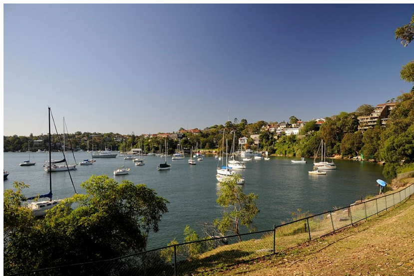
GFS from Shell Park

After getting well clear of other boats as soon after the incident as possible, a boat takes a One-Turn or Two-Turns Penalty by promptly making the required number of turns in the same direction, each turn including one tack and one gybe. When a boat takes the penalty at or near the finishing line, she shall sail completely to the course side of the line before finishing.