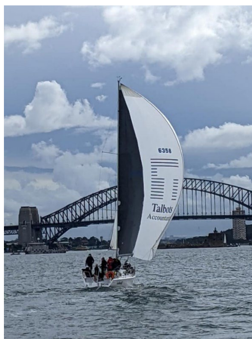
Irukandji