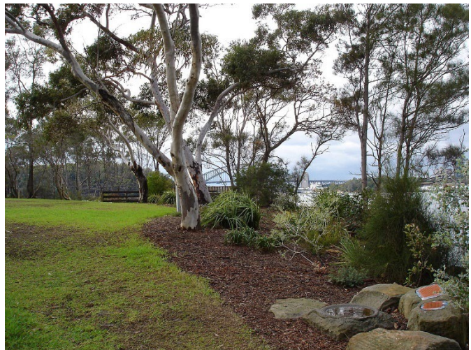
Yurubin Park