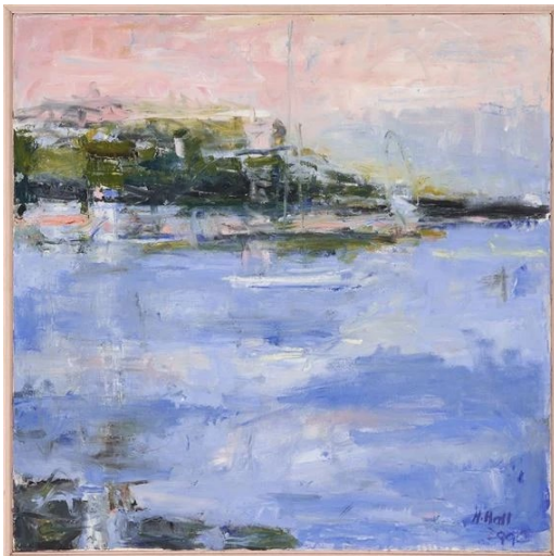
Yurubin Point, Birchgrove, 1999 H. Hall - - oil on canvas

Both Long Nose Point and the surrounding park changed to the traditional name of Yurubin , Aboriginal for 'Swift Running Water', on 8 July 1994.