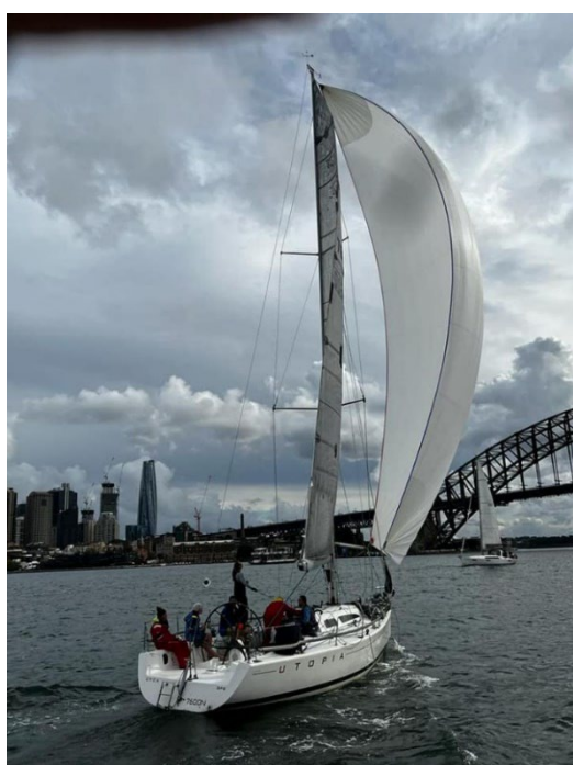
Utopia – John Amos