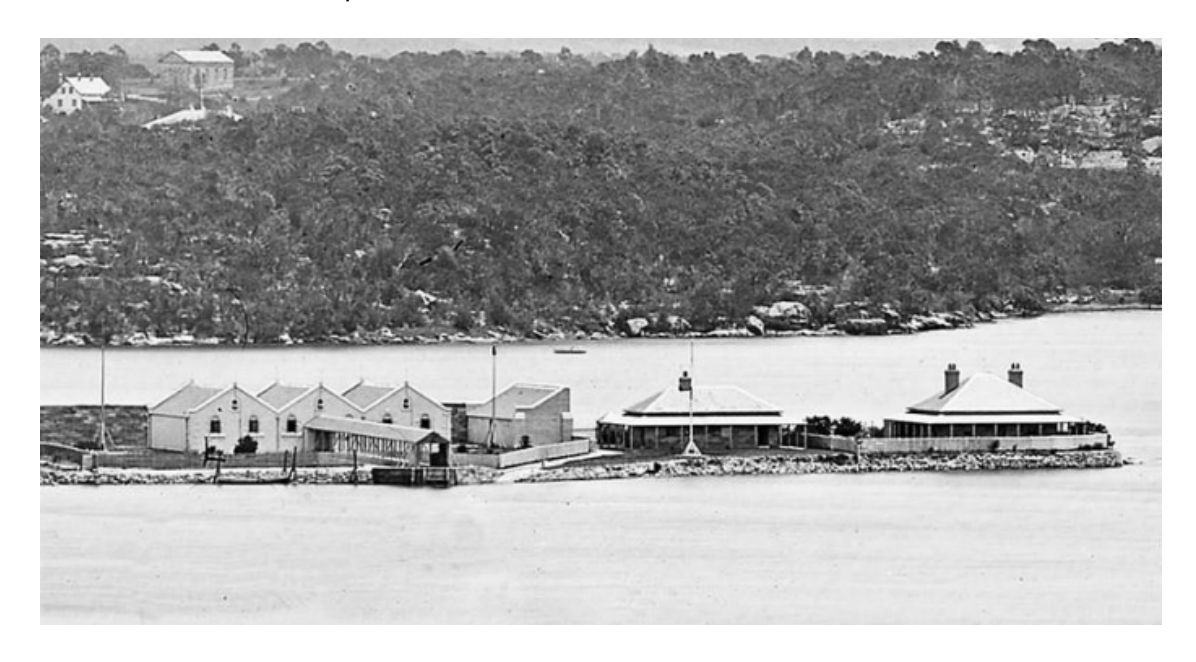
Spectacle Island Buildings Circa 1870 - L to R Magazine, Cooperage Barracks, Residence, Drummoyne shore in the background