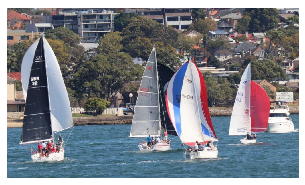
GFS contingent in WHWS Race 7 – Jester, Joka, Pistol Dawn (BSC) and WTF.

The GFS Facebook page is for members to share stories, photographs, alerts and events relevant to club and wider community events - <a href="https://www.facebook.com/groups/138966136751023/">https://www.facebook.com/groups/138966136751023/</a>.