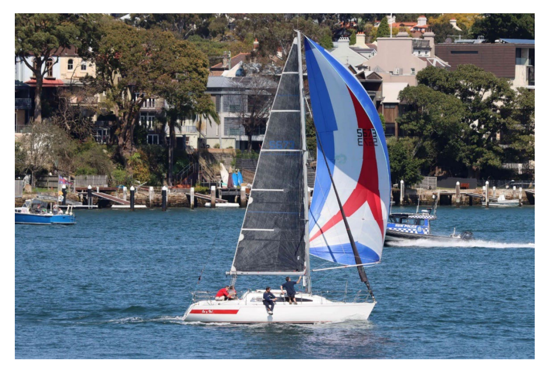
On Y Va! - WHWS Race 7 - Image Courtesy Mark Palmer