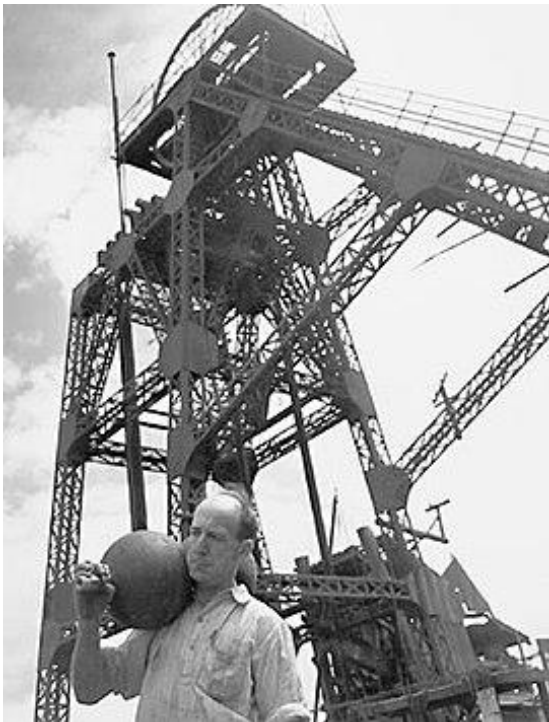
Headframe – circa 1940s

The site is now occupied by the Hopetoun Quays residential complex.