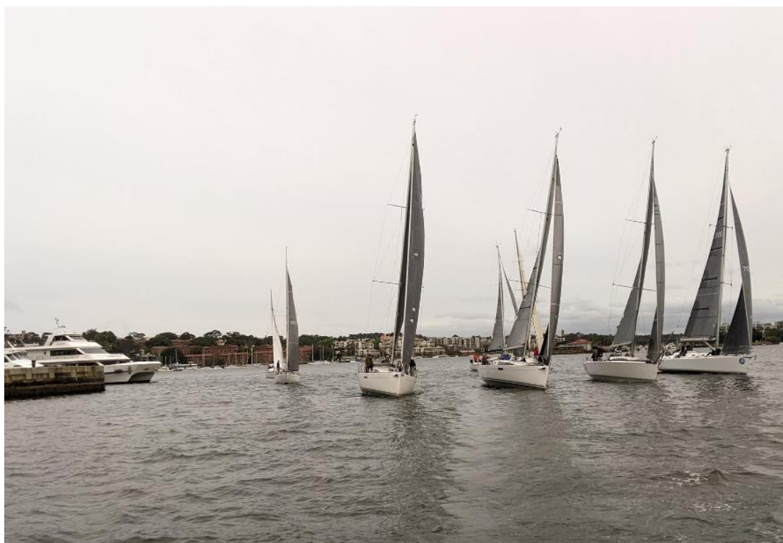
Black Division – Twilight Race 2