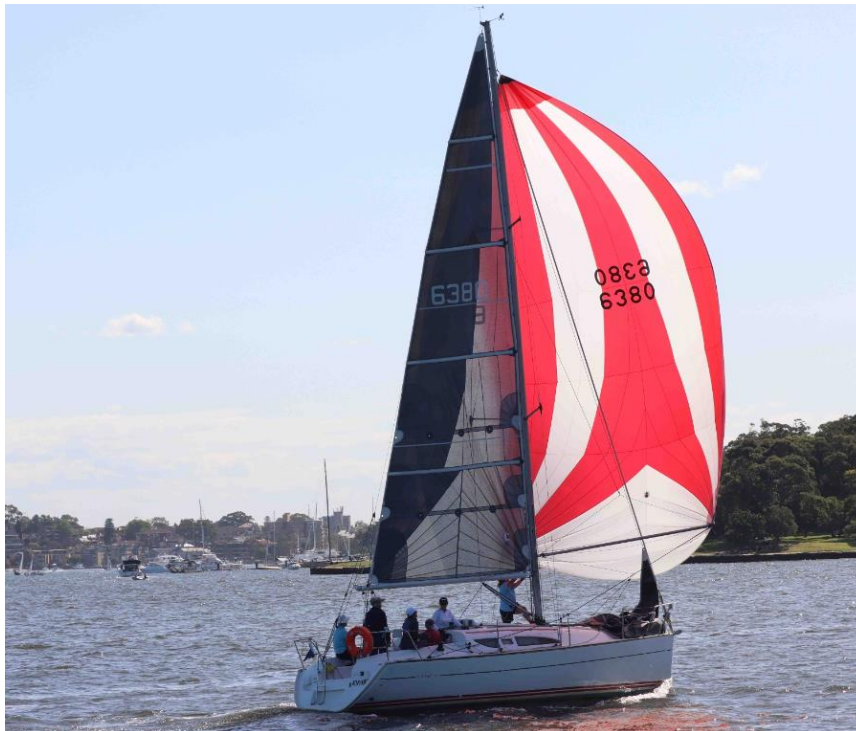
Tana – Down Harbour Race 2

The GFS Facebook page is for members to share stories, photographs, alerts and events relevant to club and wider community events - https://www.facebook.com/groups/138966136751023/ .