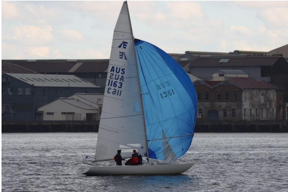
WTF – ‘Soggy Saturday’ Saturday Autumn Race 8 April 22