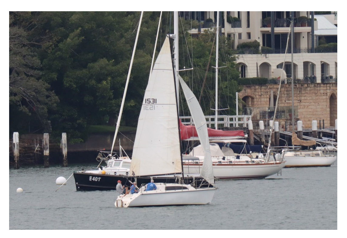
Saturday Spring Race 9

Please note below, you do not need to use a spinnaker.