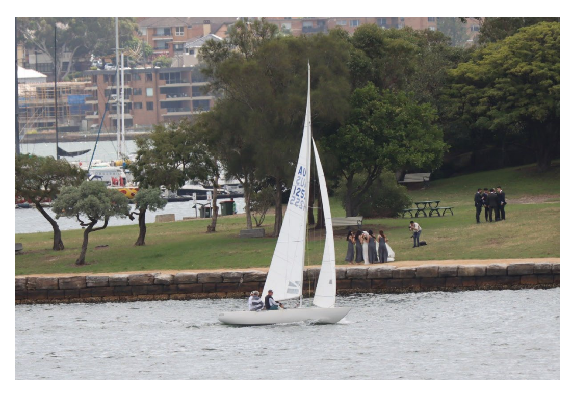
Standown crashing a wedding Saturday Summer Race 1