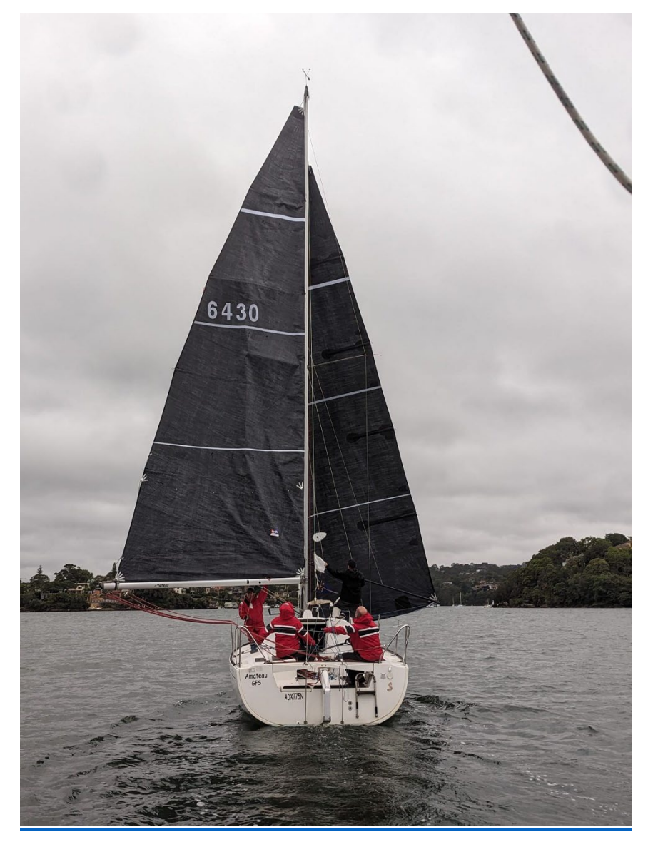
Amateau - Twilight Summer Race 3 December 20

As always there are great images on the GFS Facebook site - https://www.facebook.com/groups/138966136751023/