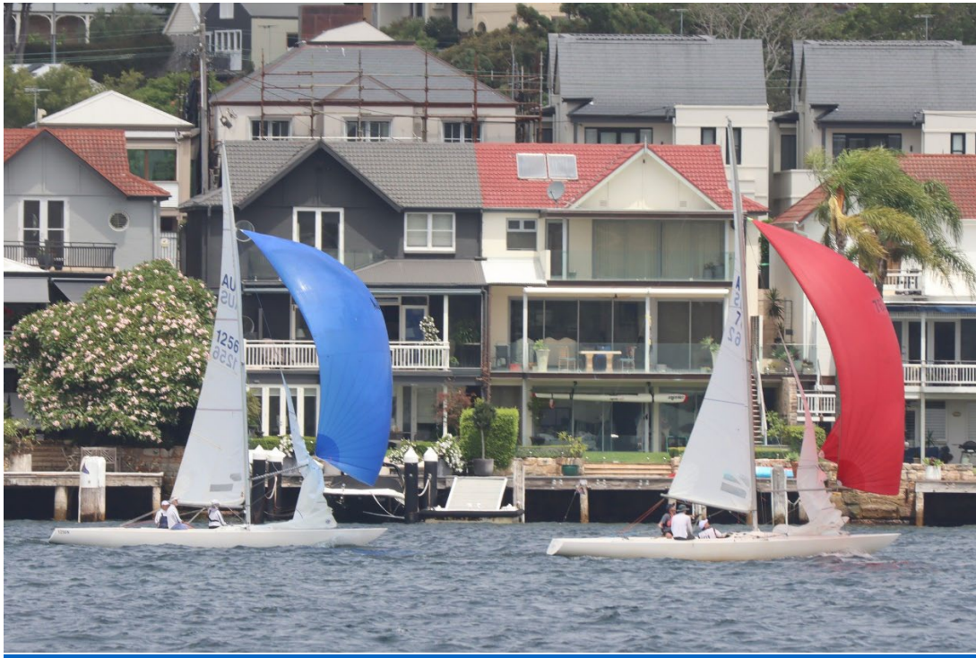
Saturday Autumn Race 1 - Birchgrove Architecture

As always there are great images on the GFS Facebook site – https://www.facebook.com/groups/138966136751023/