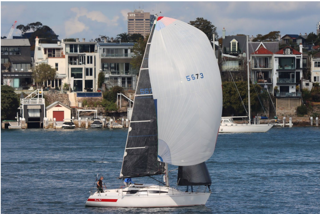
On Y Va! – WHWS Race 6

A help page for the TopYacht entry process can be found here: How to Enter a Sailing Event using the TopYacht Entry System If your boat has joint ownership please read this .