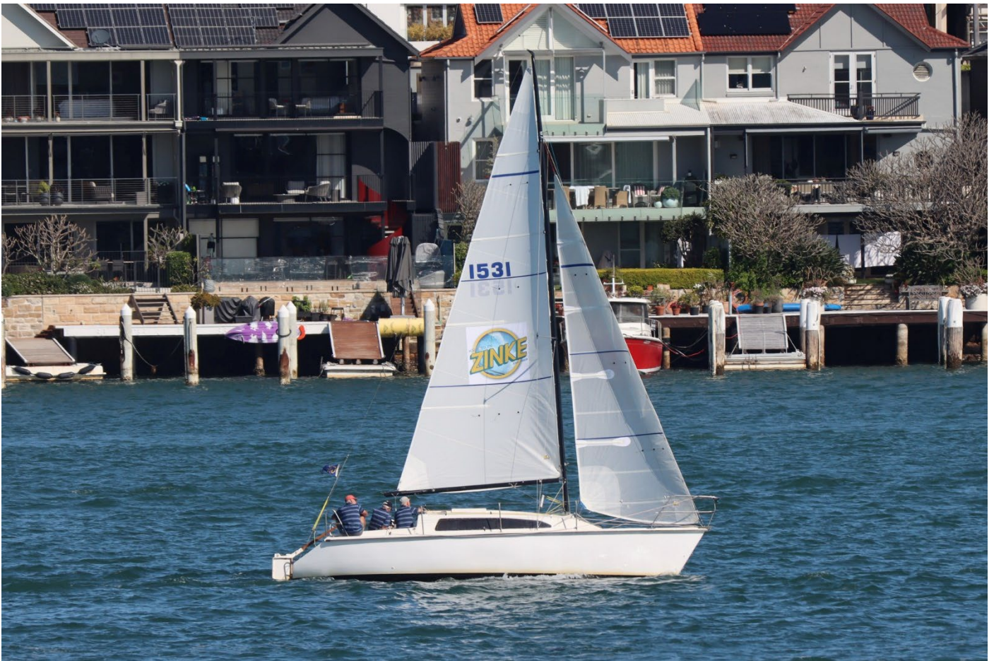
Flair Saturday Spring Series Race 2