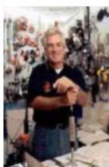
Joe Walsh Rigging

Located in Lane Cove, Zjoosh is a unique Australian lifestyle brand. It specialises in "the finishing touches". From its early beginnings as a fashion jewellery and accessories brand, Zjoosh has broadened to homeware and gifts.