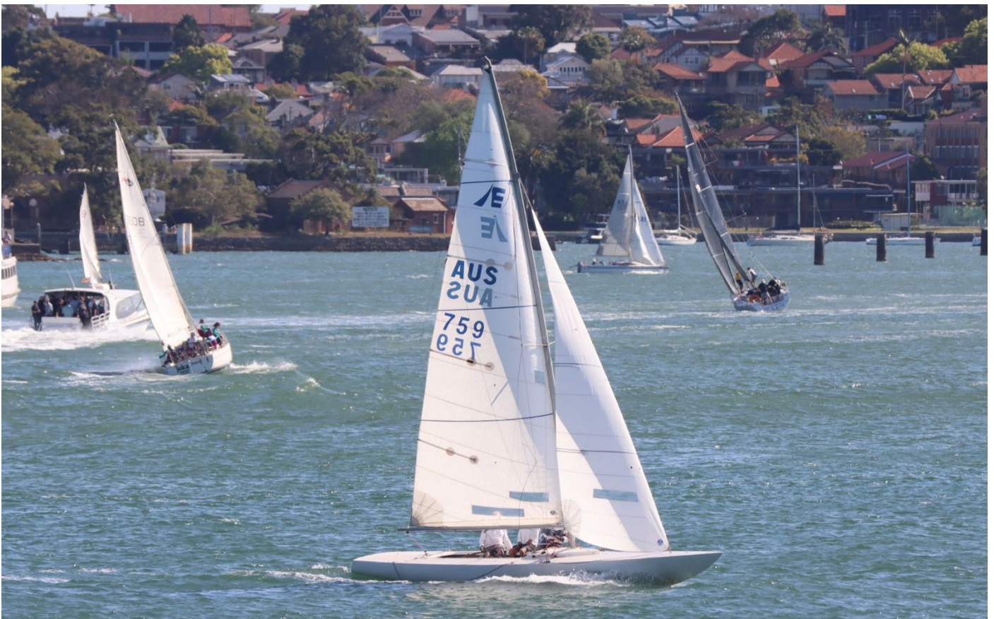
TISM, Joka and Hasta La Vista - Saturday Spring Series Race 2