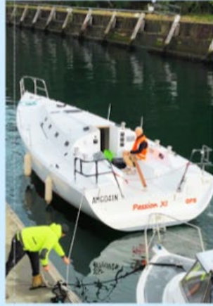
Passion XI - freshly splashed

As the fleet at Greenwich has evolved with many newer faster designs we have found the competition tougher. Kevin Dibley in New Zealand did an evaluation of Passion X to see how we could make her more competitive. Together we concluded the ballast needed to be increased and the rig enlarged.