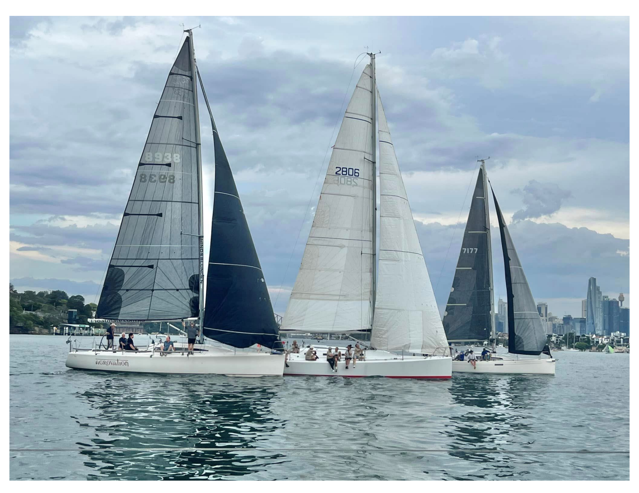
Aggrovation, Passion XI and Meridian - Twilight spring Race 8