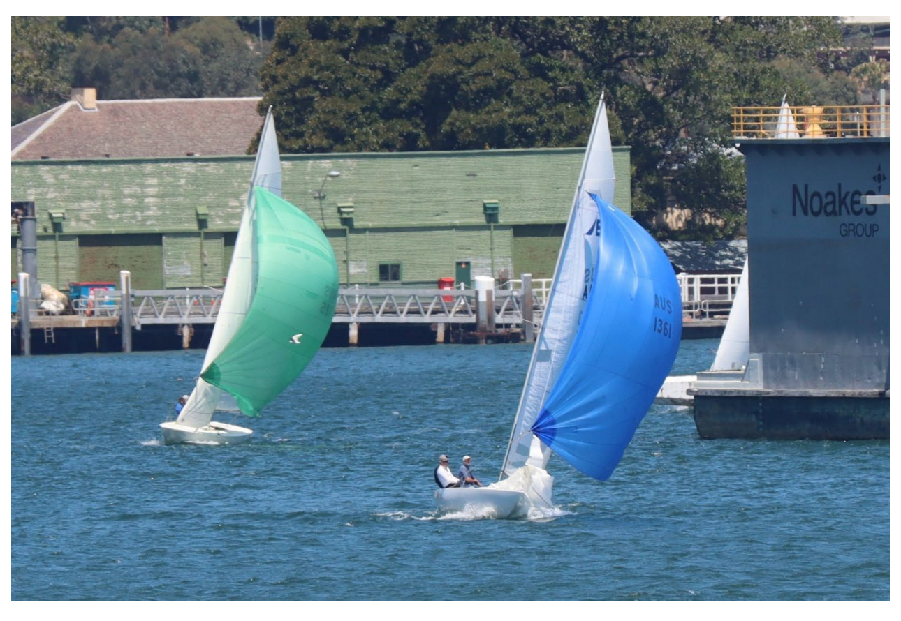
Saturday Etchells - Saturday Spring Race 8