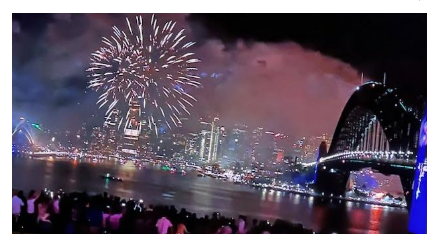
Happy New Year

Please visit the GFS website regularly for important club information.