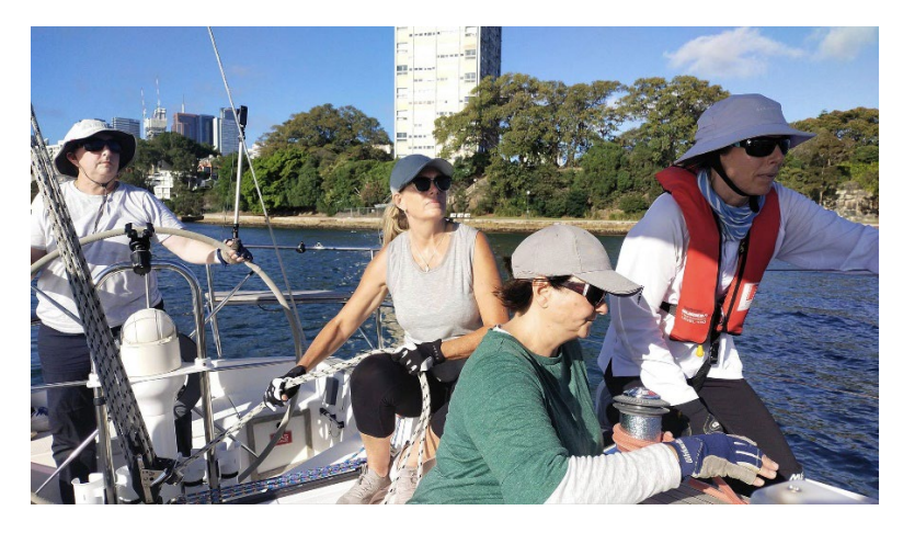
Aetos – Women's Sailing Event