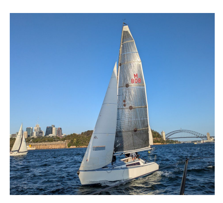
Banjo – Twilight Summer Race 2 – image Mark Palmer