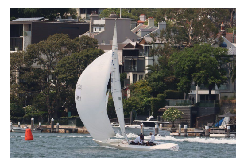
TISM – Saturday Summer Race 3