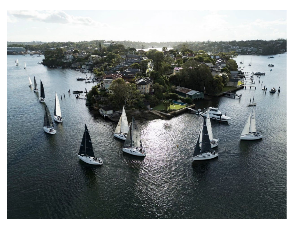
Twilight Fleet Autumn Race 1