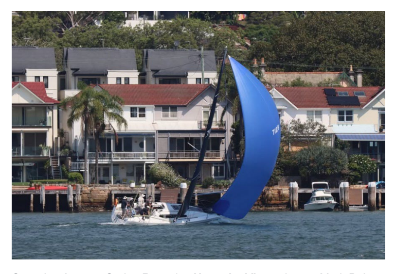
Saturday Autumn Series Race 4 – Hasta La Vista