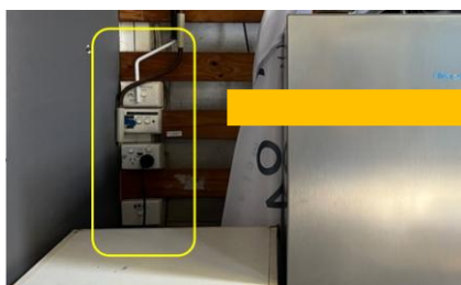
Switches to the left of the fridge

The lights are located beside the fridge near the rigging deck doors, above the afloat magazines. Turn off the 4 lights marked 'Switch' - circled in the picture. Do NOT turn off the switches marked 'LEAVE'